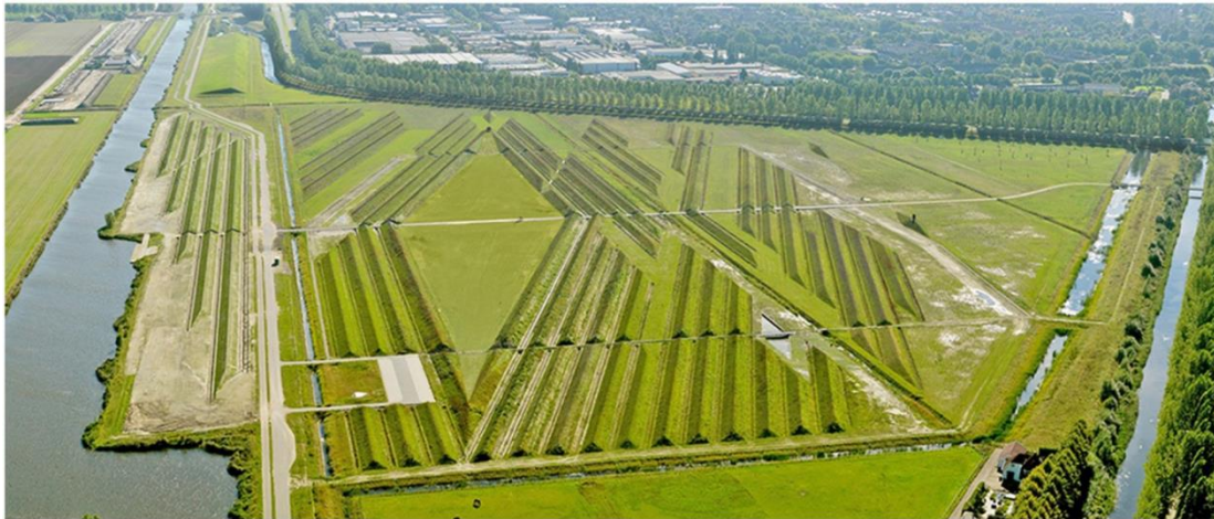
Figure 3. Buitenschot Land Art Park is an amusement park equipped with noise-reducing elements that effectively mitigate airplane noise while simultaneously offering a venue for various events and entertainment.

The system of ecological landscapes: This strategy aims to complete the enhancement of water and green areas by addressing the correlation between natural ecology and urban development. A prominent characteristic of the region is the rigorous safeguarding of ecological elements and agricultural land. First and foremost, agricultural landscapes are acknowledged as an essential element of the ecological landscape system. The objective is to improve the quality of agricultural land, maximize the effectiveness of agricultural land layout, and integrate agricultural land into a cohesive block. Then, a participatory land use-based artistic landscape is created by incorporating agricultural land, woods, and distinctive artistic features (see Figure 3). Furthermore, the emphasis is placed on the thorough utilisation of both urban and rural green spaces. The primary strategy involves significantly expanding the overall green area by utilizing the ecological spatial framework of "One Belt, Five Corridors, and Multiple Nodes" and developing designated green pathways along rivers and major green corridors. The plan stipulates that by 2035, the region will attain complete coverage of park and green route services within a 500-meter radius, with a total of 110 kilometers of green routes to be constructed. Moreover, it is vital to optimize the utilization of the water resources in the region to construct water-friendly environments (refer to Figure 3).